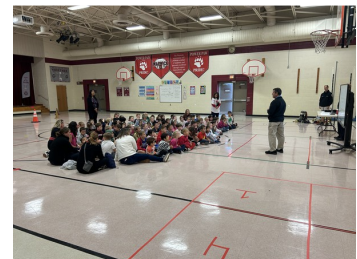
Fire Prevention Program Assembly